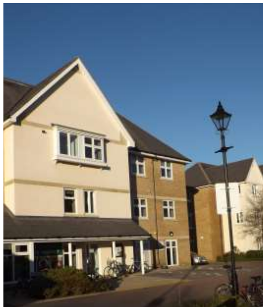
51, Clearwater Place, Oxford OX2 7NL Entrance next to Bright Horizons Nursery School